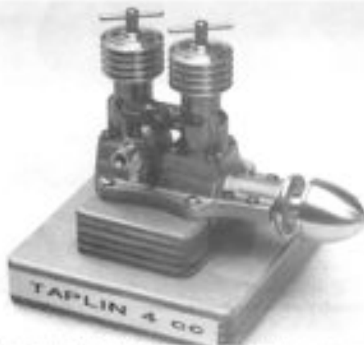
The Taplin 4cc and very nice too! Neat wooden stand, the engine was shown at the recent Watford (London) Swapmeet.