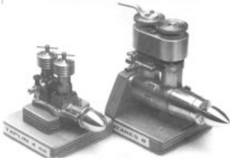
Taplin 4cc and Antares 8cc